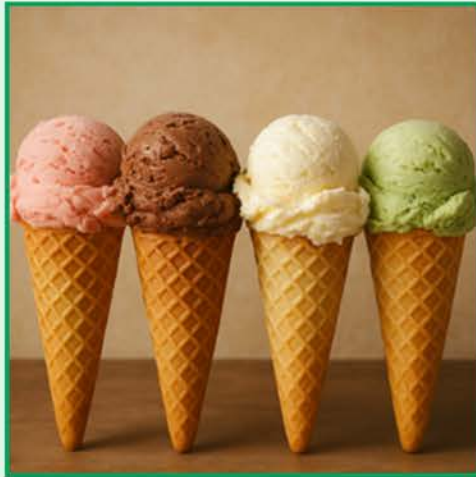
Tasty ice cream flavours