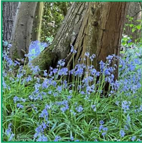
Bluebells in the woodlands