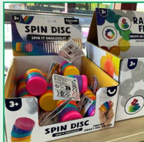
Fidget toys in the gift shop