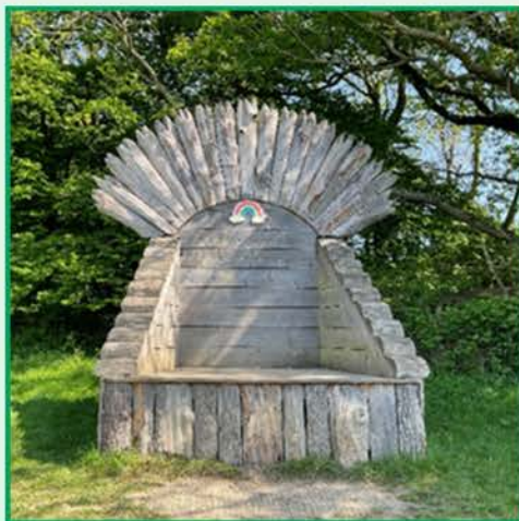
The Giants Chairs