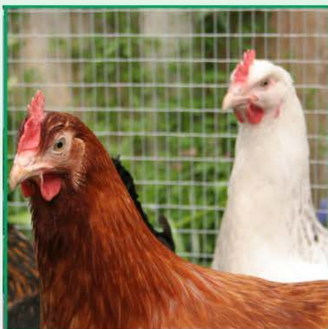
Cluck cluck cluck!