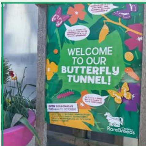
Heat in the Butterfly Tunnel