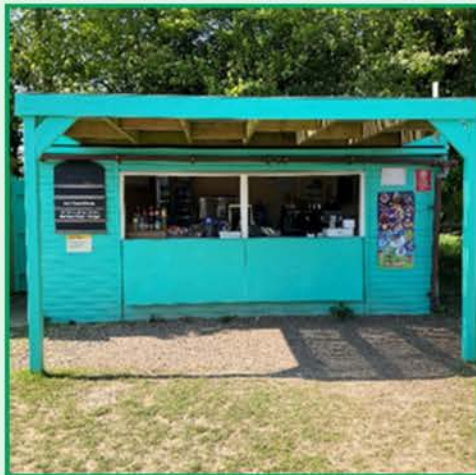
A panini at the food kiosk