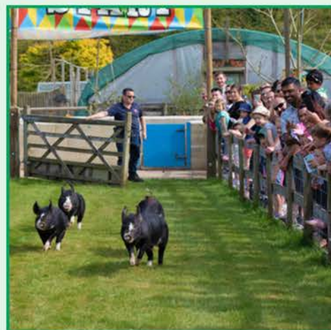
Happy children cheering the pig racing