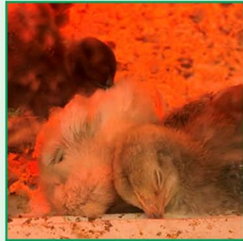
Newly hatched baby chicks