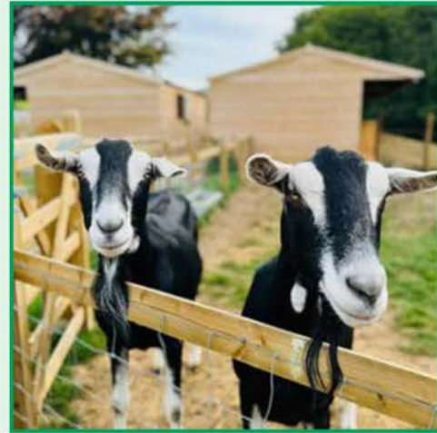
Goats in their paddock