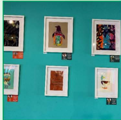
'Art on the Farm' in The Gallery