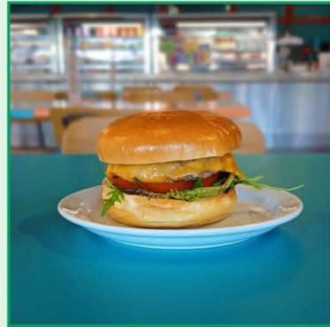
Food at the Granary Restaurant