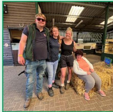
Chatter of the life skills students