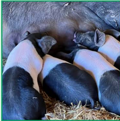
Animals in the Children's Barn