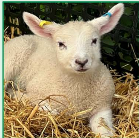
Hay in the lambing tunnel