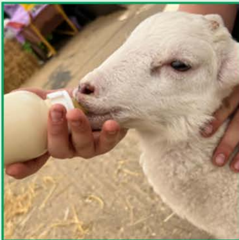
Soft lamb's wool during feeding