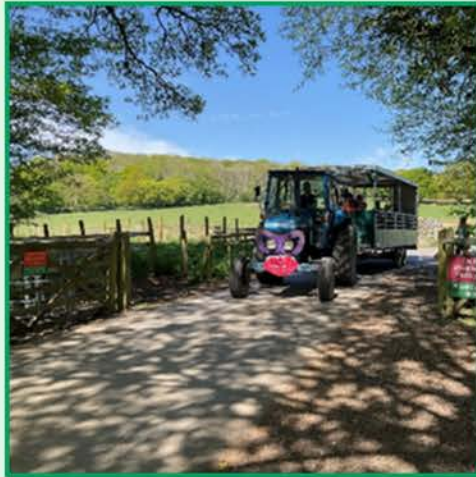
The tractor trailer