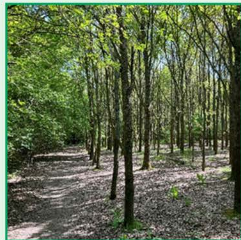
Big, tall trees