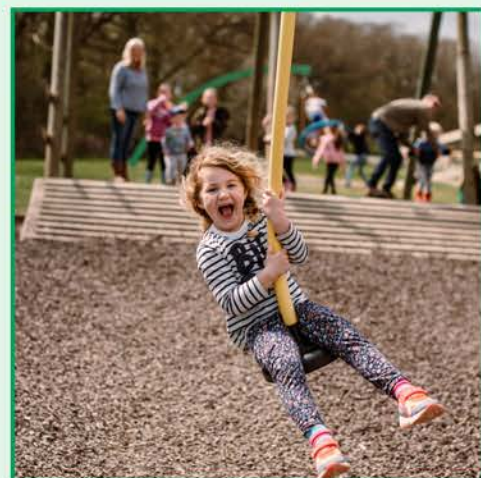
Wind in my face on the zip wire