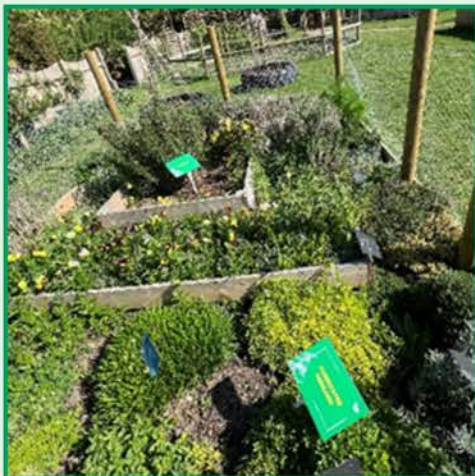
Herbs in the Discovery Garden