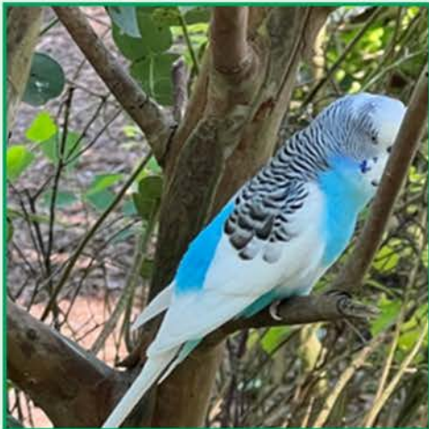
Birds in the Aviary